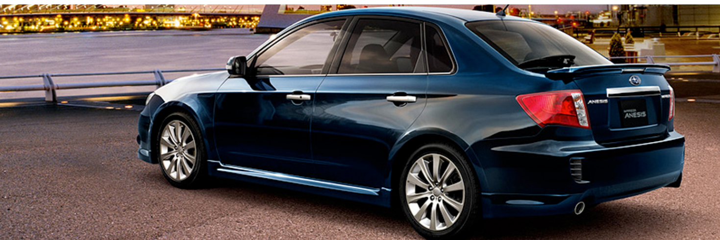
IMPREZA 4Door (GE)

Please consult with your local SUBARU dealership or an authorized SUBARU distributor to confirm the availability, price and installation. Colors shown may vary due to displays and printing processes.