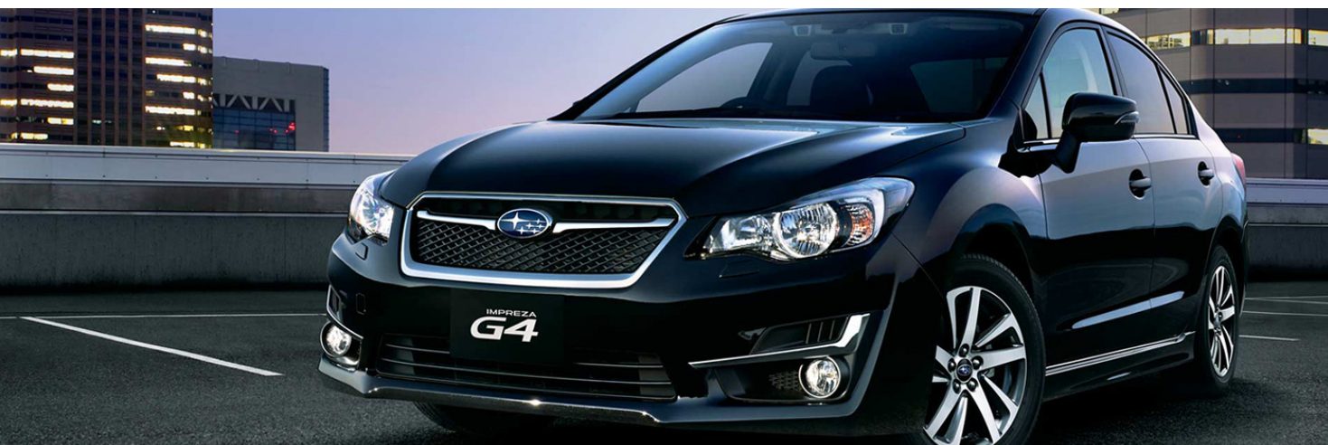
IMPREZA 4Door (GJ)

Please consult with your local SUBARU dealership or an authorized SUBARU distributor to confirm the availability, price and installation. Colors shown may vary due to displays and printing processes.