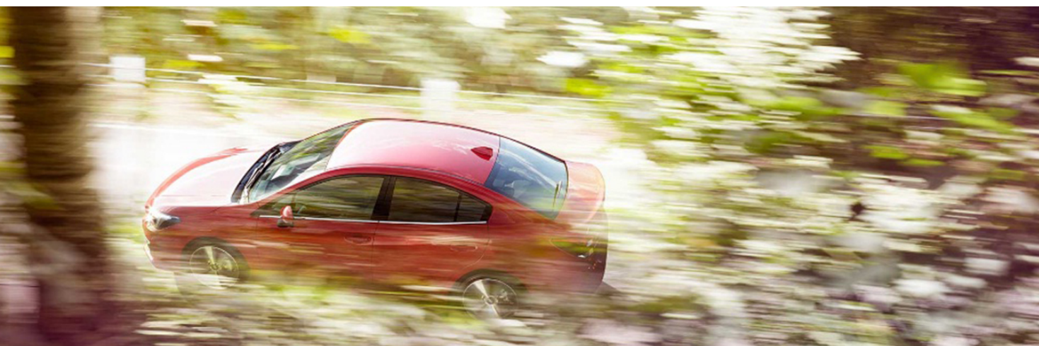
IMPREZA 4Door (GK)

Please consult with your local SUBARU dealership or an authorized SUBARU distributor to confirm the availability, price and installation. Colors shown may vary due to displays and printing processes.