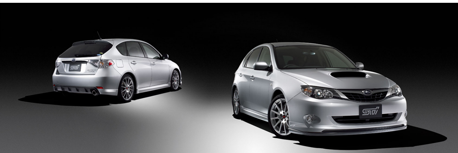
IMPREZA 5Door (GH)

Please consult with your local SUBARU dealership or an authorized SUBARU distributor to confirm the availability, price and installation. Colors shown may vary due to displays and printing processes.