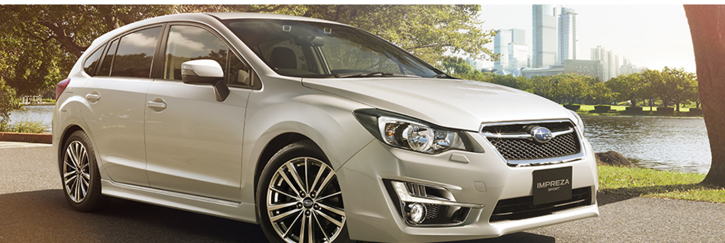
IMPREZA 5Door (GP)