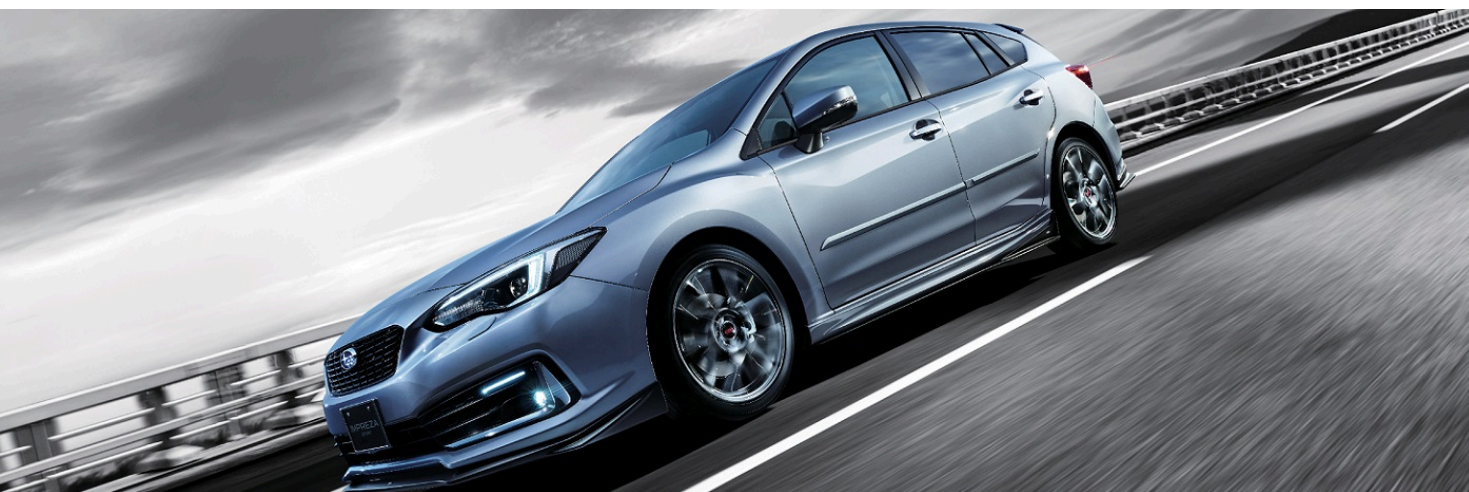
IMPREZA 5Door (GT)

Please consult with your local SUBARU dealership or an authorized SUBARU distributor to confirm the availability, price and installation. Colors shown may vary due to displays and printing processes.