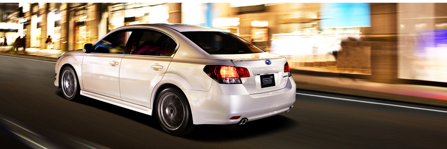
LEGACY B4 (BM)

Please consult with your local SUBARU dealership or an authorized SUBARU distributor to confirm the availability, price and installation. Colors shown may vary due to displays and printing processes.