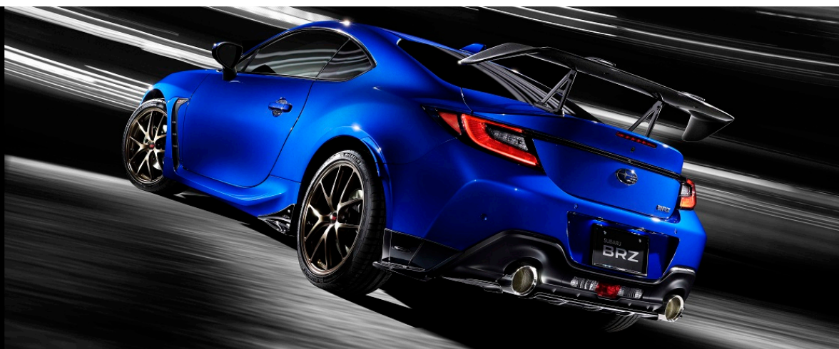
SUBARU BRZ (ZD)