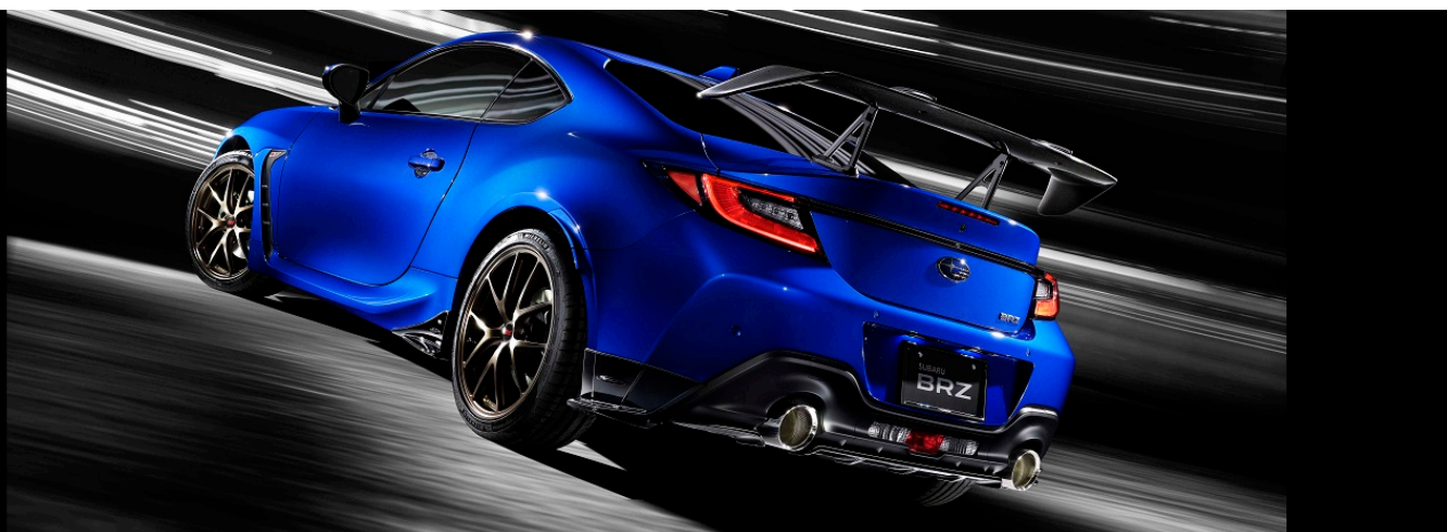
SUBARU BRZ (ZD)

Please consult with your local SUBARU dealership or an authorized SUBARU distributor to confirm the availability, price and installation. Colors shown may vary due to displays and printing processes.