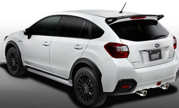
SUBARU XV (GP)

Please consult with your local SUBARU dealership or an authorized SUBARU distributor to confirm the availability, price and installation. Colors shown may vary due to displays and printing processes.