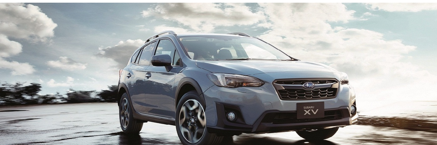
SUBARU XV (GT)

Please consult with your local SUBARU dealership or an authorized SUBARU distributor to confirm the availability, price and installation. Colors shown may vary due to displays and printing processes.