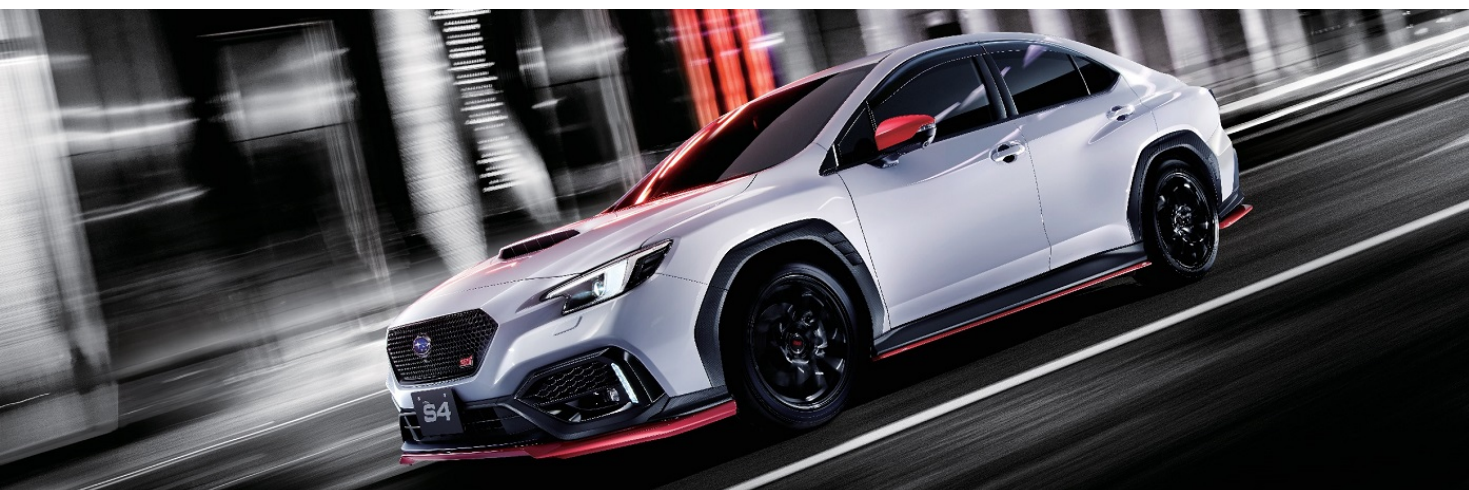
WRX S4 (VB)

Please consult with your local SUBARU dealership or an authorized SUBARU distributor to confirm the availability, price and installation. Colors shown may vary due to displays and printing processes.